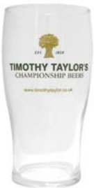
Timothy Taylor's Championship beers tulip pint glass