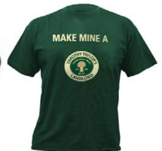
Landlord T shirt